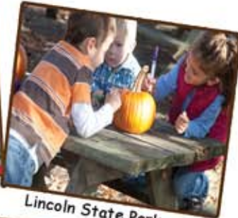
Lincoln State Park

Ever wonder what Abraham Lincoln did as a child? Was he always so honest and humble? Find out in Lincoln's Indiana Boyhood Home where young Abe lived from the time he was 7 until he was 21.