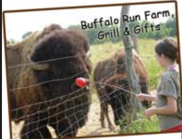
Buffalo Run Farm, Grill & Gifts