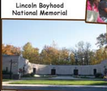
Lincoln Boyhood National Memorial

Also, you won't want to miss a chance to travel back in time to the good ole' days of drive-in movie theaters at one of the few remaining, Holiday Drive-In. With five screens and two concession stands you'll be able to watch your favorite movies under the stars and on the big screen in Reo, Indiana!