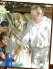
Living Historical Farm

Take a relaxing look back into history with 14 Lincoln-era replica cabins and an artifact-filled museum at the Lincoln Pioneer Village & Museum in Rockport, near the Ohio River. Stop by Lincoln Landing where Abe launched his first flatboat trip to New Orleans, inspiring his anti-slavery views, and see Lincoln Ferry Park where he was sued over his ferry business, sparking an interest in law.