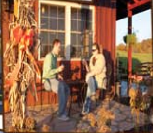
Monkey Hollow Winery