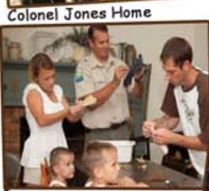
Colonel Jones Home

See a replica of Lincoln's homestead and visit the Living Historical Farm at Lincoln Boyhood National Memorial. 2012 marks the park's 50th anniversary.